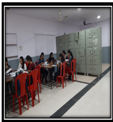
Girls Common room

Separate and spacious common rooms are available for both boys and girls. Girl's common room is well equipped with all the facilities including a first aid box, sanitary napkin dispensing an incinerator to dispose of the sanitary napkins. Washroom facilities are available for girls on all the floors of the college building. Also, fire safety equipment is made available.