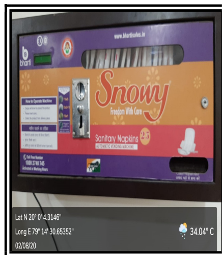
Sanitary napkin dispensing machine