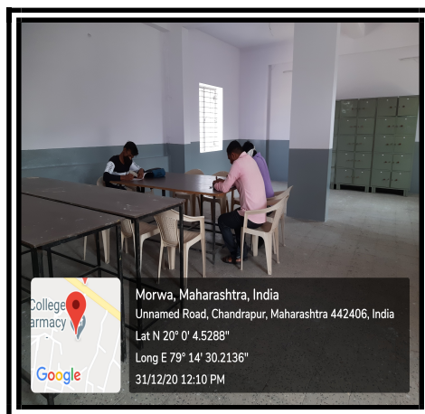
Boys Common room