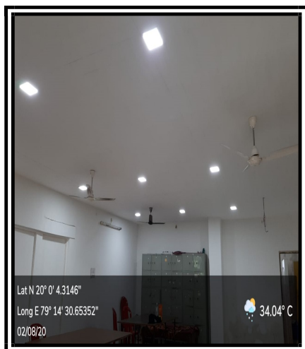
Girls Common room